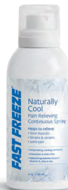
Continuous Spray 4oz