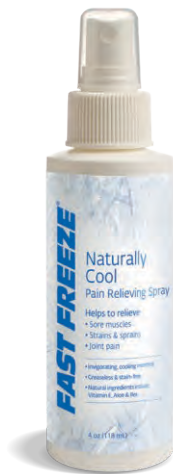
Pump Spray 4oz

Spray Items: 10% Menthol | Gel Items: 3.5% Menthol